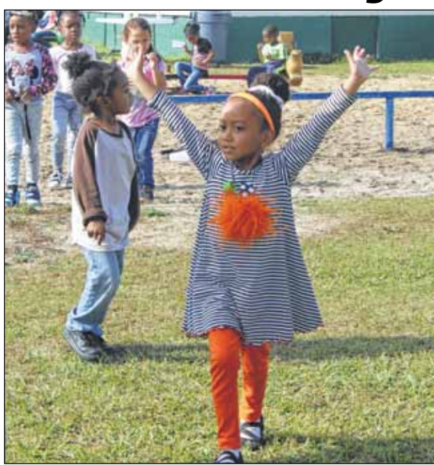
Some children at the Maxton block party were already dressed with Halloween spirit.

The program has centers in Laurel Hill, Laurinburg, Maxton, Elizabethtown, Longwood, Raeford, Mt. Olive, Pembroke, Piney Grove, Ransom, Red Springs, South Robeson, St. Paul’s and Tabor City.