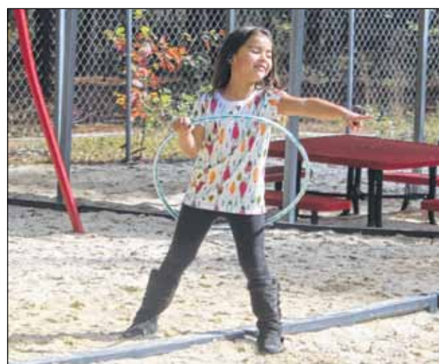
Hula hoops kept many children entertained during the Laurel Hill Head Start block party.