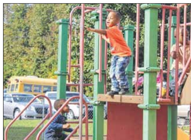
Children played on the Maxton playground during the Head Start Center event.