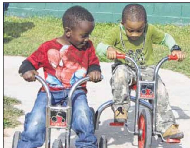
Children raced on tricycles during Thursday’s block party.