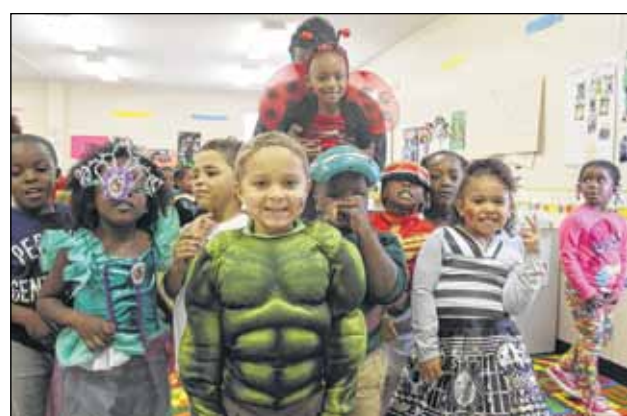
The Laurinburg Head Start block party had children decked out in the Halloween spirit.